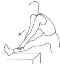
Standing hamstring stretch