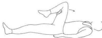
Single knee to chest stretch